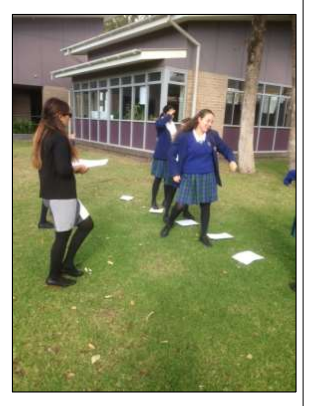
58A Orwell Street Blacktown, NSW 2148