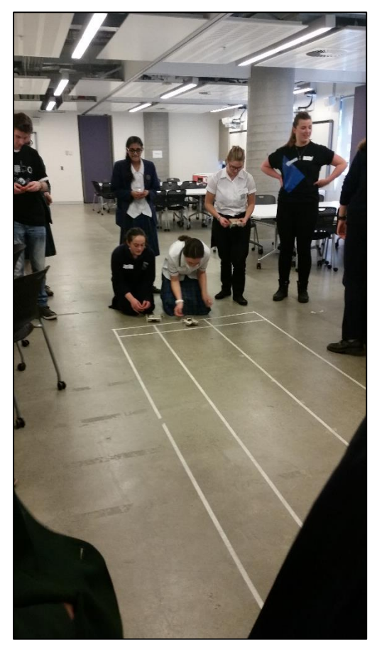
58A Orwell Street Blacktown, NSW 2148