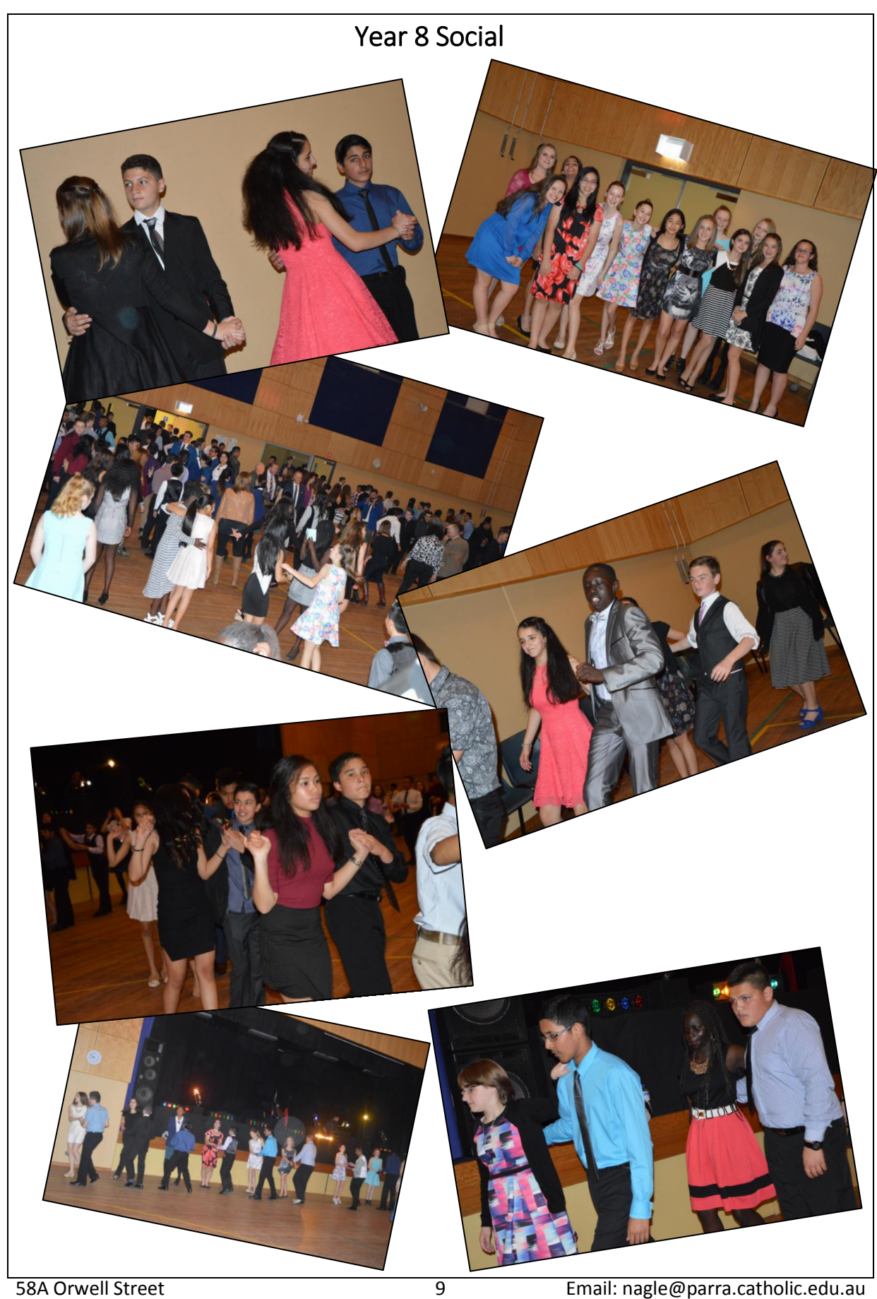
58A Orwell Street Blacktown, NSW 2148

Email: nagle@parra.catholic.edu.au Ph: 8887-4501