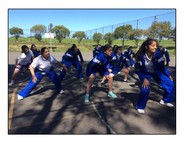
58A Orwell Street Blacktown, NSW 2148